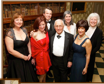
Founders Award Dinner Committee